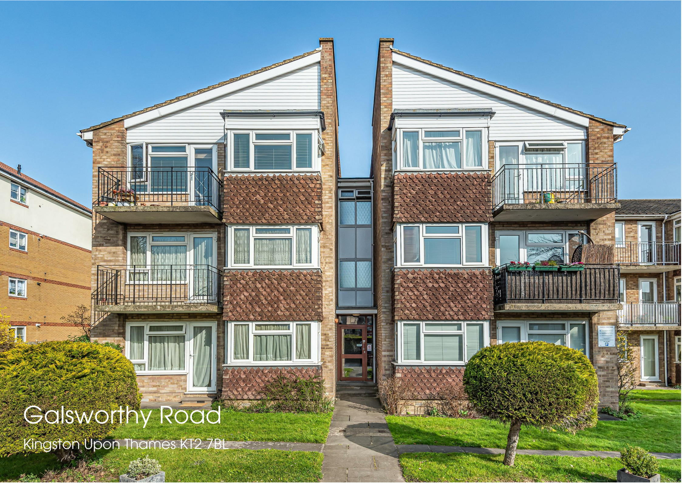
Galsworthy Road Kingston upon Thames KT2 7BL

34 Richmond Road Kingston upon Thames Surrey KT2 5ED www.gibsonlane.co.uk Tel: 020 8546 5444